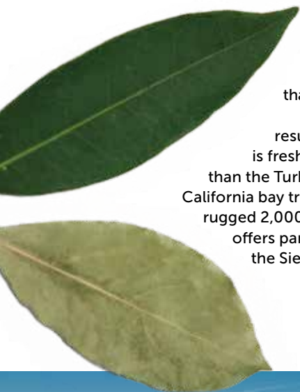
Paul Attard, above, integrated Napa Mountain's technology that dries leaves in 20 minutes into scalable equipment, resulting in California bay that is fresher and greener, at left top, than the Turkish variety. Some 100,000 California bay trees flourish on the family's rugged 2,000-acre ranch, below, which offers panoramic views that include the Sierra Nevada, Mount Diablo and, on clear days, the Golden Gate Bridge.

A side-by-side look shows the Turkish leaves are brownish and wide compared to California bay leaves, which are long, slender and bright green.